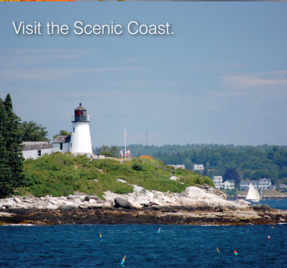
Visit the Scenic Coast.