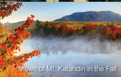
Views of Mt. Katahdin in the Fall.