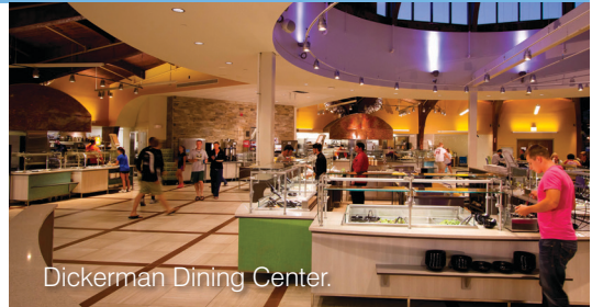
Dickerman Dining Center.