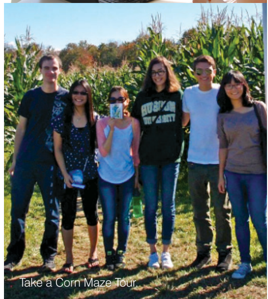
Take a Corn Maze Tour.