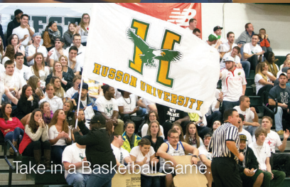
Take in a Basketball Game.