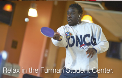
Relax in the Furman Student Center.